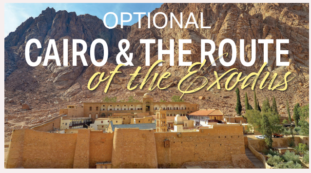
April 29 - May 5, 2026 | Starting at $2,099*