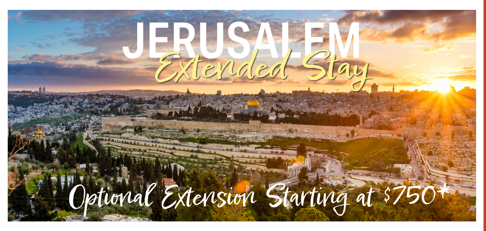
Day 10 to 12 - Enjoy time in your Jerusalem area hotel on your own. Breakfast and dinner are included at your hotel.

Day 13 - Transfer to the airport and return home with memories to share.