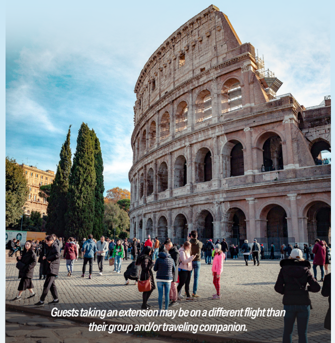
Guests taking an extension may be on a different flight than their group and/or traveling companion.

Transfer to the airport for your return flight to the USA.